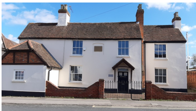
The Mitfords in Three Mile Cross, home of author Mary Mitford in first half of the 19 th century

The Basingstoke Road starts in Three Mile Cross where there is lots to look out for: Hawthorne Cottage, the church behind the Mitfords, the Post Office with its old barn at the back, Wistaria Cottage and four pubs (The Swan, Fox and Horn, George and Dragon and The Star) of which only The Swan remains today. There is also the old Chapel for which SWLHG has produced a history. The road on your right at the cross roads leads towards Grazeley, as the name implies, but it is now cut off by the bypass. At the far end, Grazeley Road is crossed by Woodcock Lane which is very old and was the 'low road' avoiding the hill. Note the ancient pond where the lane starts. On the left at the crossroads is Church Lane which leads to the parish church, St. Mary's in Shinfield.