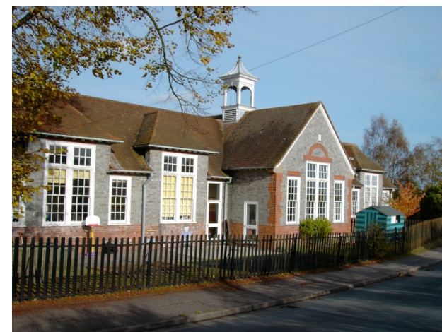
Lambs Lane School was built in 1908 on the edge of the village to serve both Spencers Wood and Swallowfield. The two existing schools were closed.

Further down Basingstoke Road there are a cluster of businesses: the bakery has been there forever, the Post Office has been modernised and on the opposite side of the road a small industrial estate. The Red Lion used to be next door but has been converted into homes and a close but the garage has been there for many years and featured in the Group's first book.