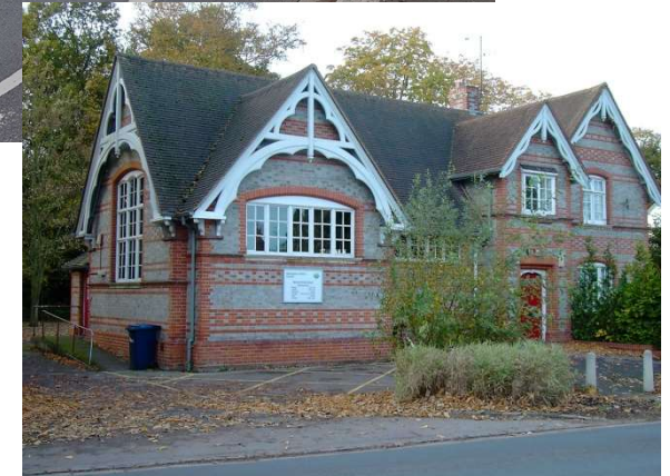
The former United Reformed Chapel, now converted to apartments and the Library, formerly the village school.