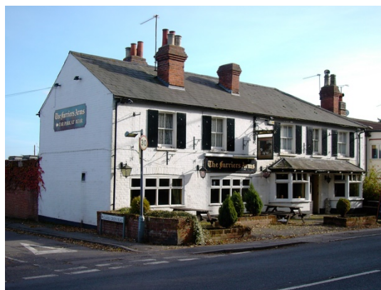
The Farriers on the corner of Clares Green Road dating to before 1860,

Grovelands Road. Beyond the bend, on your right, you'll find a drive leading to Shinfield Cemetary where you can pause and be reminded of past residents of Spencers Wood.