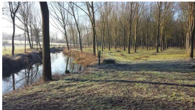
The River Loddon near Kings Bridge. The river is an SSSI which is home to a range of protected species including Loddon Pondweed, barn owls, red kites, otters, water voles and great crested newts. There are also invertebrate species such as white admiral and small heath butterflies and stag beetles.

The footpath on the left just before the Bridge will take you back to the Basingstoke Road along the River Loddon, emerging beside the Mill House Hotel, formerly Sheepbridge Mill. The Loddon continues East and is joined by the rivers Blackwater and Whitewater. It can be seen again in the newly created SANG in Hyde End Road before emerging at Arborfield Bridge on the Shinfield-Arborfield road. In the past there were a number of mills on all three rivers, including one in Riseley and another one at Stanford End.